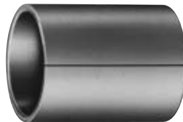
Split Sleeve Coupling For joining Split Duct to existing duct.