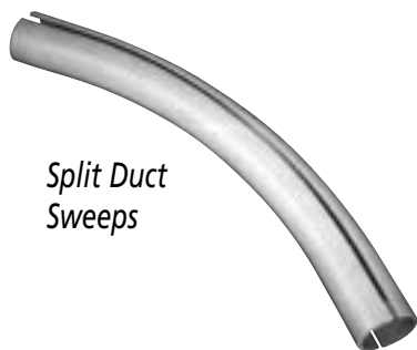
Split Duct Sweeps