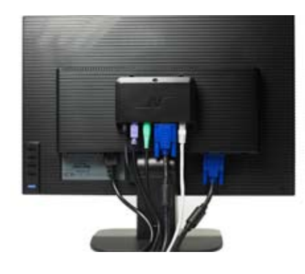
XD2 access device rear view